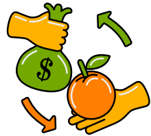
BUYING & SELLING