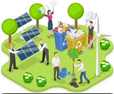
TOKENIZATION OF RWA