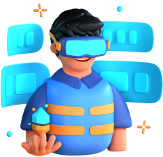
GAMING & METAVERSE