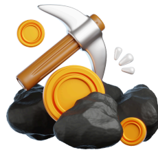
STAKING & MINING